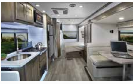
24FW shown with Driftwood II cabinetry and Milano décor.