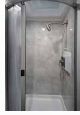
24FW shown with Driftwood II cabinetry and Milano décor.

All information contained in this brochure is believed to be accurate at the time of publication. Please be advised that the stated Standards and Options are subject to change during the model year due to factors outside of the direct control of Dynamax, such as supplier changes/shortages. Dynamax also often makes running changes during the model year to improve reliability, performance, and/or capacity. Please refer to www.dynamaxcorp.com for the most current specifications.