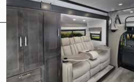
24FW shown with Shadow cabinetry and Crescent décor.