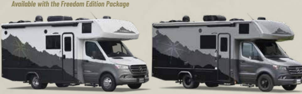
Freedom Edition Light Freedom Edition Dark shown with optional black aluminum wheels